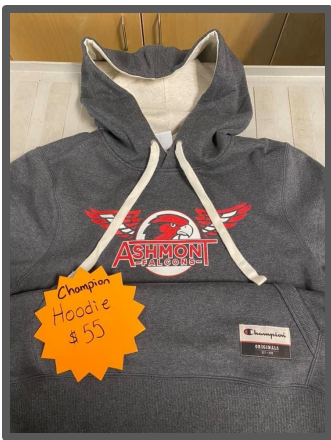
CHAMPION HOODIE $55