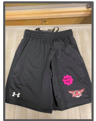
UA SHORTS $45