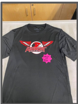
WARMUP SHIRTS (LONG AND SHORT SLEEVE) $20